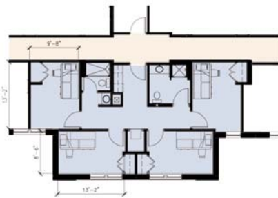
4 Single Bedrooms

outdoor common space. The Commons is unique and dynamic for the inclusion of incorporating communities within a community. The 16 community living rooms will have comfortable furnishings that will create unique spaces for students and groups to conduct study sessions, group meetings or to congregate with friends. The Commons will